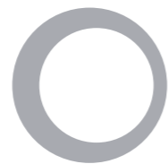
Cross section of a cold drawn tube with variations in wall thickness