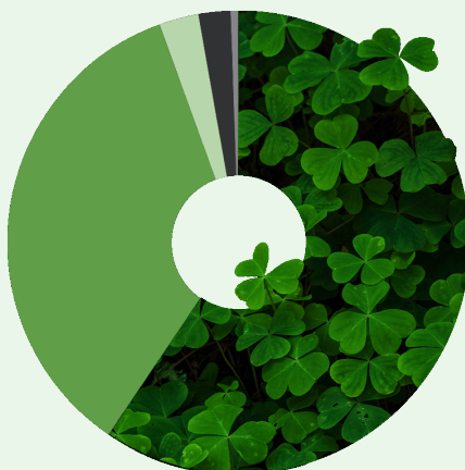
Net sales / operating segments 2021

The long-term goal of the Group is to have sales growth of 20-30% annually and via an increased degree of automation and thus increased scalability in the business reach a gross margin of over 40% and an operating margin (EBIT) by 20%. At the same time, the Group shall become climate neutral by 2023 at the latest, which means zero emissions of greenhouse gases and 100 percent use of biobased raw materials and packaging.