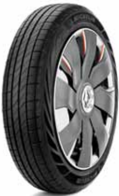
Renault Eolab by MICHELIN

During the International Motor Show in Frankfurt in 2015, the last 12 years' work of the Michelin Design Studio on concept car tyres for the world's car manufacturers will be shown through both the tyres presented on the stand and its « Concept Tyres Book ».