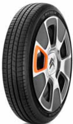
Citroën C4 Cactus by MICHELIN

The Michelin Design Studio has worked in partnership with Bugatti on the sidewall design of the slick tires chosen for their Bugatti Vision Gran Turismo concept presented in Frankfurt. The clean design highlights both the MICHELIN visual identity and the blue of the Bugatti vehicle, giving the virtual race car an extremely dynamic expression.