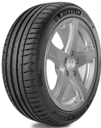
MICHELIN Pilot Sport 4

... Shows the work of the Michelin Design Studio on the tyres presented on the stand and through its « Concept Tyre book » - merging technology and design in the service of performance and style. Premium Touch technology is an example of this.