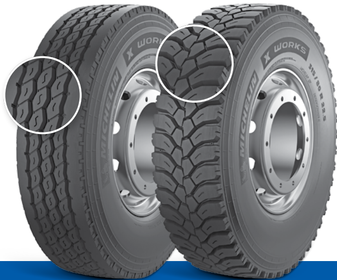
MICHELIN X® WORKS™ XDY

The harsh usage conditions of worksite supply activities require tyres that can roll both on asphalt and withstand the harsh conditions of terrains full of potholes, stones, rebars, etc. The technologies behind MICHELIN X® WORKS™ tyres bring a more decisive performance. What are they? Enhanced resistance to harsh conditions and increased service life