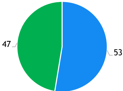
All cat owners

It is slightly more common to have an indoor cat, especially among the younger age group.