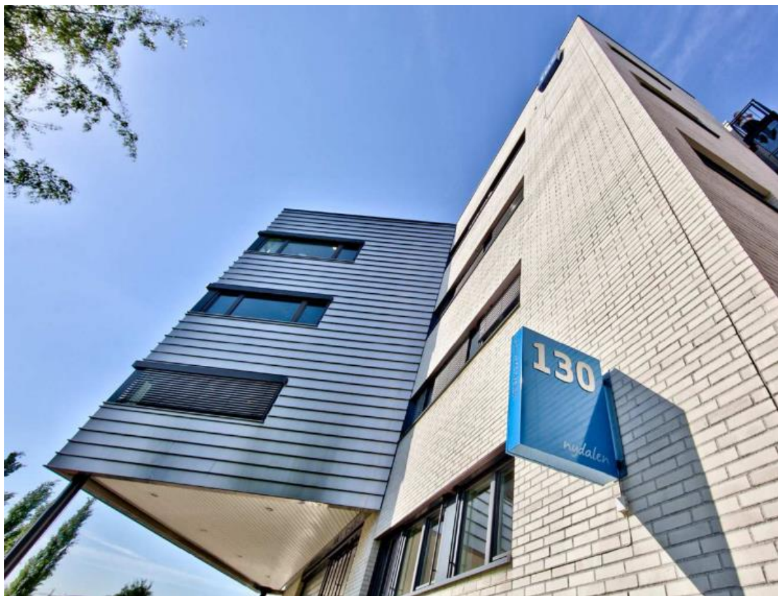
Sandakerveien 130, Nydalen