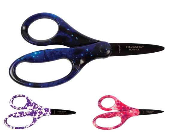
5" Designer Non-stick Kids Scissors