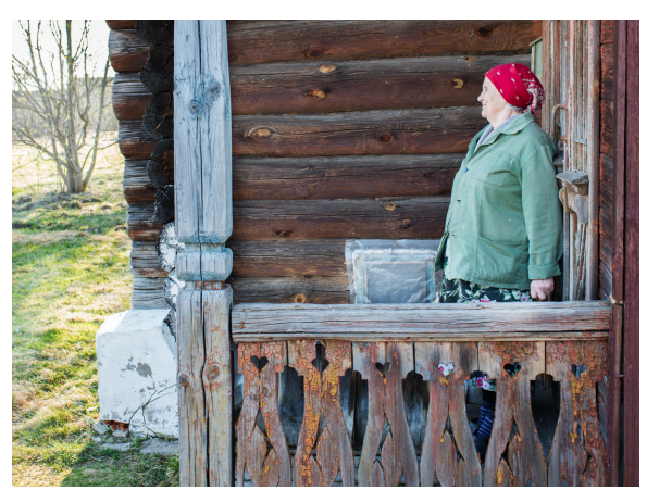
Goodbye, my friend, goodbye