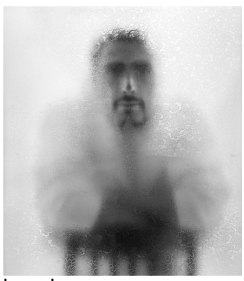
beyond © Loredana Nemes