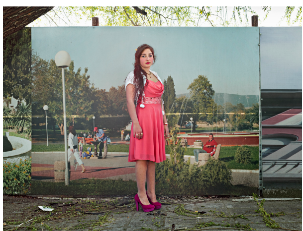
The bartered bride © Pepa Hristova