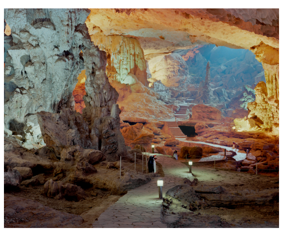
Show Caves