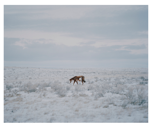
The buffalo that could not dream © Felix von der Osten