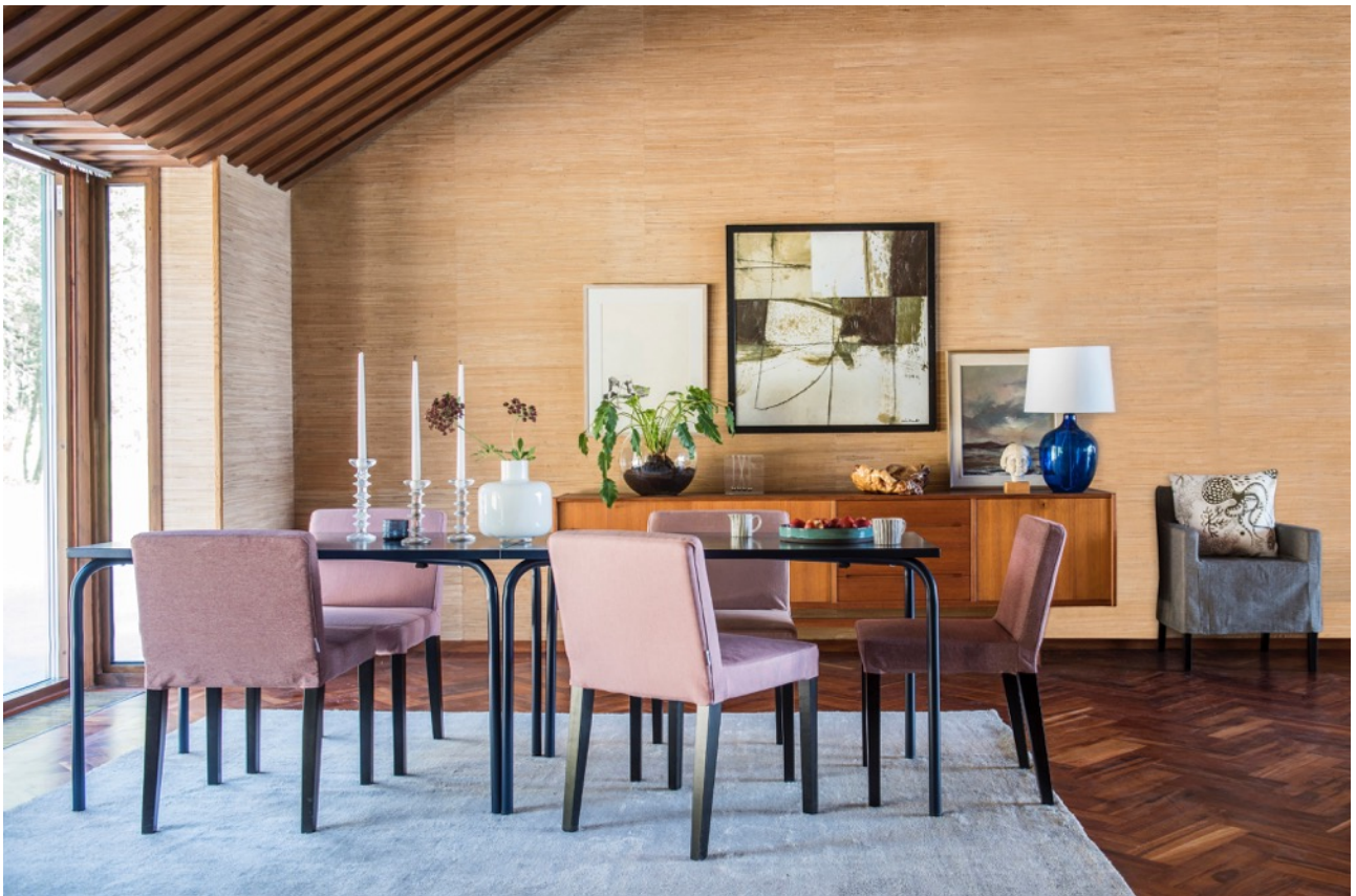
Bemz covers for the Nils chair in [NEW] Lunda Melange Rosewood and [NEW] Brunna Melange Rose.