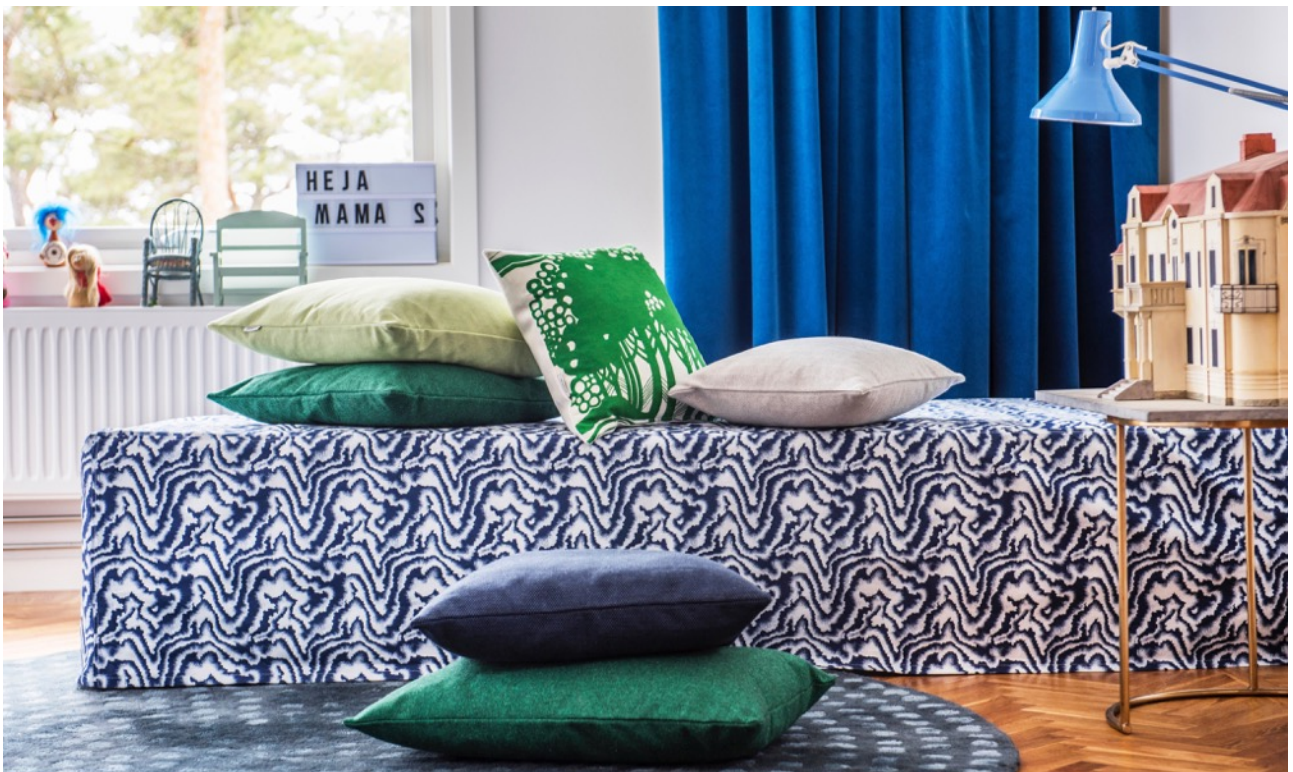
Bemz daybed cover in [NEW] Betula Deep Navy Blue.

The design team at Bemz have brought the Respect collection to life with the latest trend report, Scandi Retro which embraces this season's hot colour story, blending textures and light to create a classic and inherently Scandinavian look. Scandi Retro is a vivid impression where subtle and harmonious can mix with bold yet serene, with a nod to 70s aesthetic.