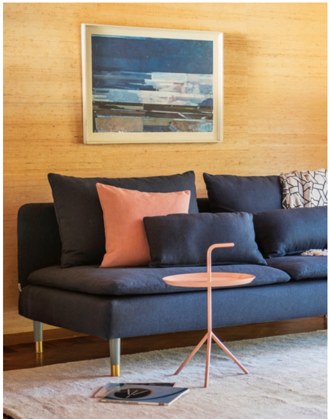
Bemz cover for Abelvär headboard in [NEW] Lunda Melange Daiquiri. Bemz cover for Söderhamn sofa in [NEW] Brunna Melange Ink Blue.