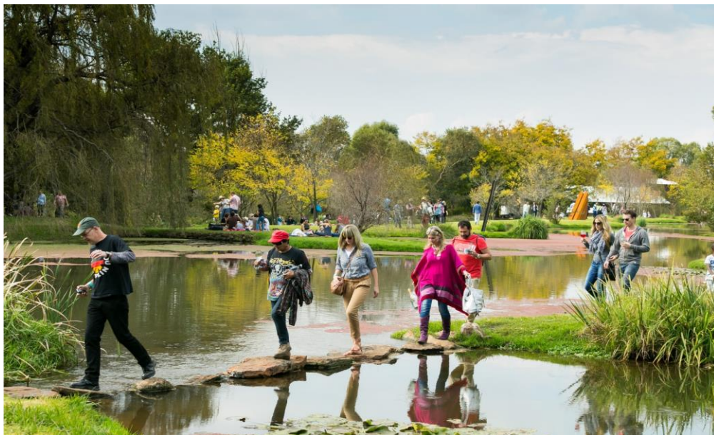
The 2018 American Express Winter Sculpture Fair is a family-friendly event that caters to Joburgers.