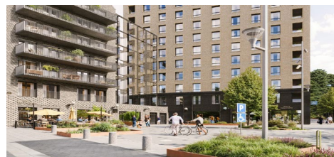
Next fall, Ölstugan Tullen will open in Kallebäcks Terrasser's most central block, Kvarteret Torget.