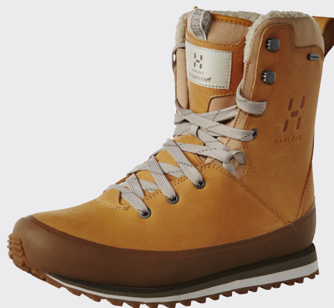
HAGLÖFS KRYLBO GT WOMEN