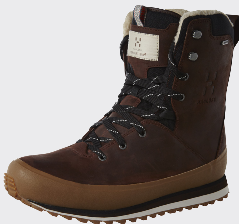
HAGLÖFS KRYLBO GT MEN