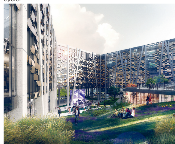
Symetri is contributing to innovative urban buildings in the Økern Portal project – a sustainable office building full of innovative solutions in one of Oslo's newest city areas.

Customers' willingness to invest is driven by urbanisation and the need to build efficiently and sustainably. To be more efficient, customers are digitalising their processes and adopting new ways of working. Regulatory authorities are requiring greater use of digital work processes based on BIM, i.e., digital models of a building or infrastructure along with the accompanying assets during the entire lifecycle.