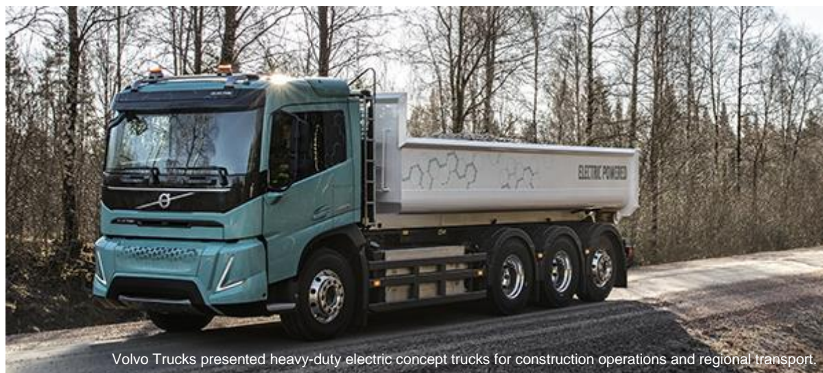
Volvo Trucks presented heavy-duty electric concept trucks for construction operations and regional transport.