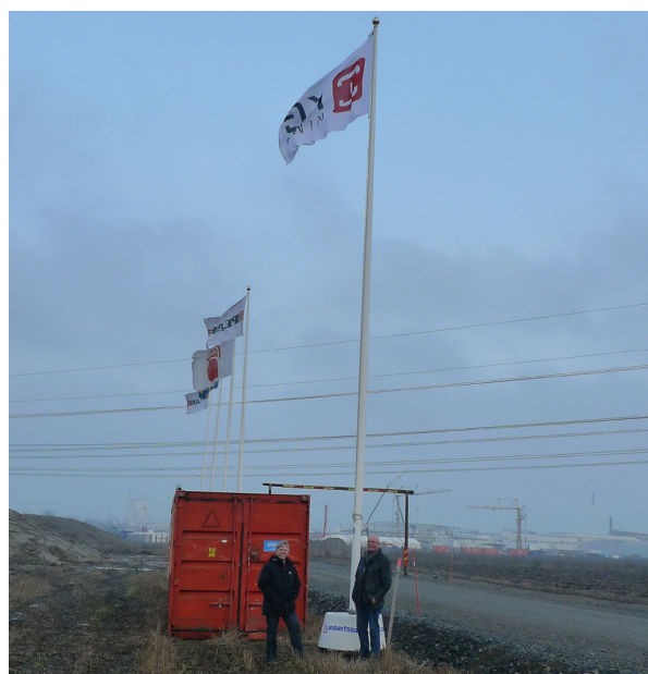
Raising the flag. Torsten Palmgren and Stefan Olsson at the site of the coming new Findus factory.

"We will work intensively on this project throughout 2014. The facility includes a hefty platform in stainless steel with a total of 17 tipping devices and the same number of isolated buffer pockets. Each pocket has its own vibrating chute underneath, which shakes the fro-