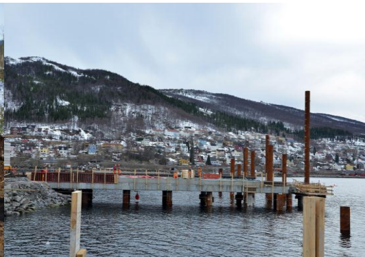
Construction work on the jetty in Narvik.

Additional photos and video clips are available on Northland's website, www.northland.eu