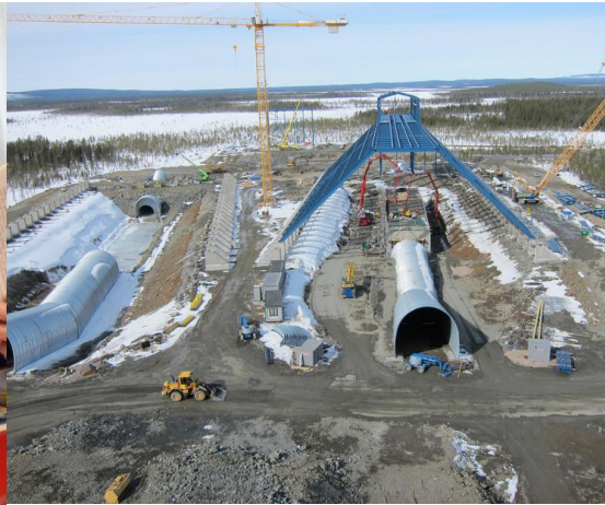
Construction of the Tapuli ore stock pile.