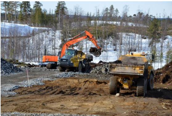
Construction work on the transloading terminal in Pitkäjärvi.