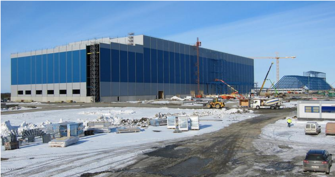
In the foreground, the Kaunisvaara Process Plant and behind it, the ore stock pile for ore from the Tapuli mine.