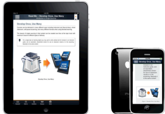
Content on multiple devices

To register for a live demo the new features of Xyleme LCMS, sign-up at the Xyleme website .