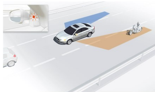
1S Blindspot Information System