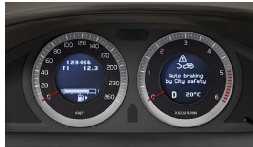
City Safety – activation message