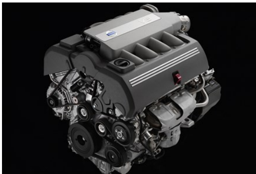
Volvo 4.4-litre V8