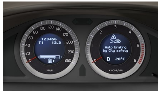
City Safety - activation message