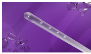
Fig. 2: LoFric® Elle™ Pro introduces twelve smooth Pro eyelets developed to further simplify catheterization, support complete bladder emptying and provide greater reassurance for women who rely on intermittent catheterization (IC) in their daily lives.