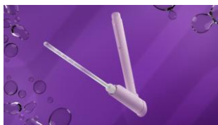
Fig. 1: LoFric® Elle™ Pro is a hydrophilic, ready-to-use intermittent catheter designed to allow for bladder emptying in one free flow, without the need for repositioning.