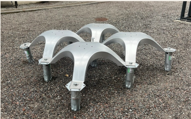
FIG. 01 PHYSICAL DEMONSTRATOR – FOUR MODULES PER SQUARE METRE

Each 500×500 mm module distributes point loads radially across an adjacent network of arches, turning the floor grid itself into a structural system. Four modules form one square metre; the same unit repeats from a single-pad configuration to a full 16×16 m vertiport without any design modification.