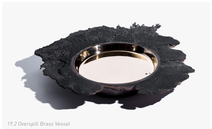
19.2 Overspill Brass Vessel