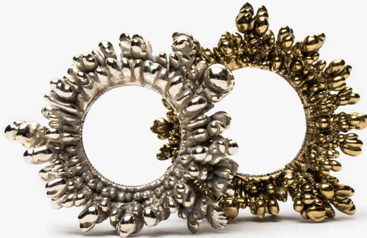
71 Electromagnetic Accretion Jewellery

The newly established OAO Works will present its launch collection at de Vera during New York Design Week 2018.