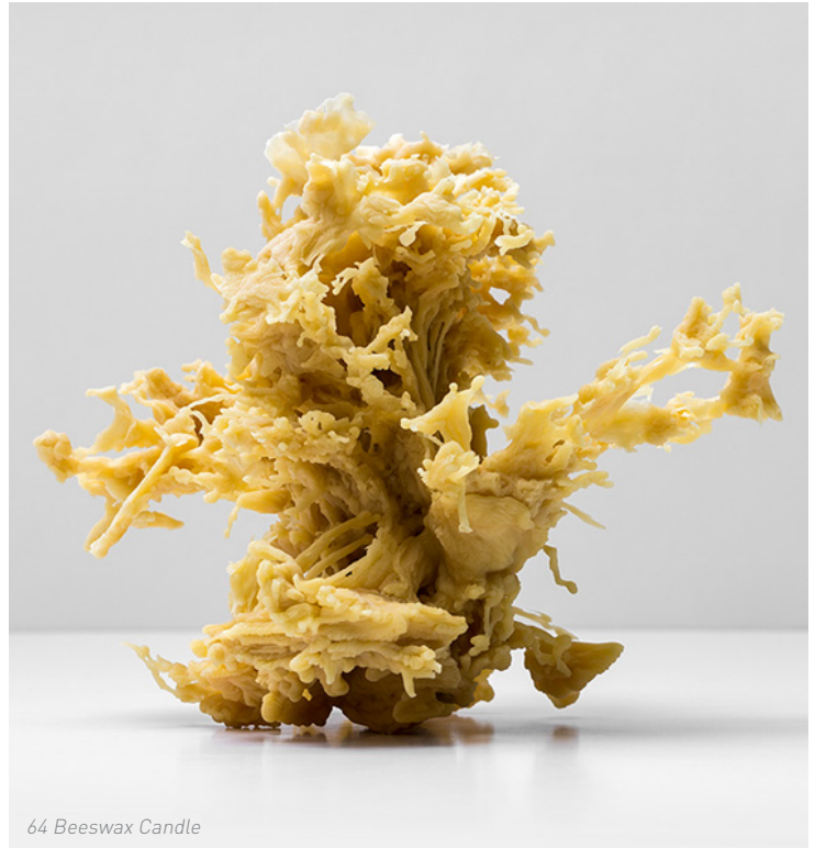
64 Beeswax Candle

Omer Arbel Office is the creative hub of a constellation of companies (OAO Works and Bocci among them), operating in different territories and structured to realize ideas of various scale across a spectrum of environments and contexts.