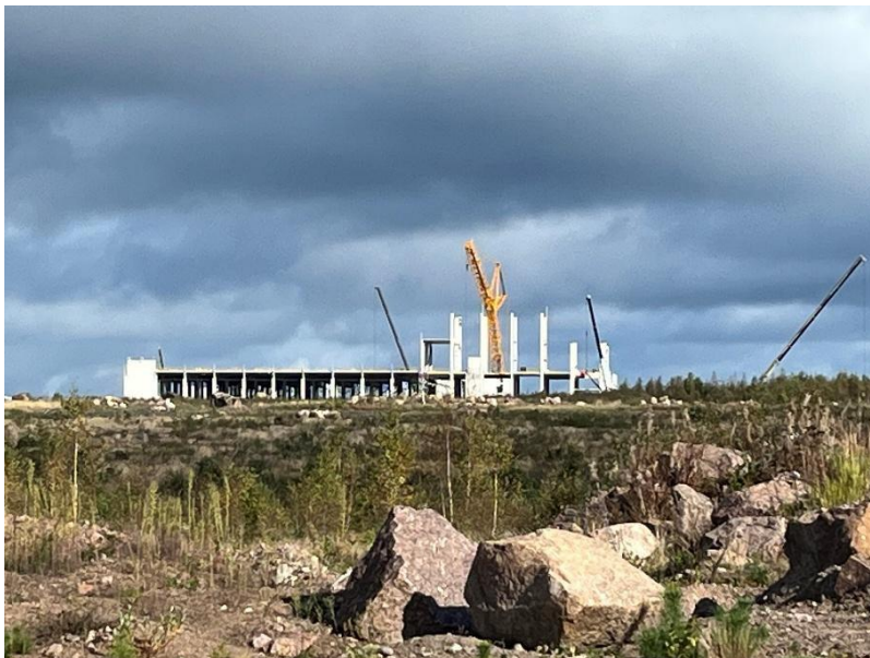
Figure 2: Construction progress at Easpring site, viewed from the GAMP site

Grafintec will participate in a number of public events during the development and operation of the GAMP to ensure local stakeholders are kept apprised of activities and have a forum to ask questions and raise concerns. The Company's objective is to be open, transparent and accountable, listening to our local stakeholders so that their concerns can be addressed or mitigated.