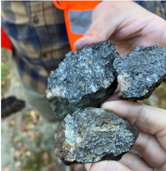
Figure 3: Graphite mineralisation from Rääpysjärvi project

Aitolampi, with a Mineral Resource Estimate of 26.7 million tonnes at 4.8 per cent total graphitic carbon (“TGC”) for 1,275,000 tonnes of contained graphite, is one of Europe’s largest flake graphite resources. Metallurgical test-work has demonstrated the ability to produce a high-grade flotation concentrate, the potential feedstock for GAMP, that the particle size distribution for the project is amenable to Coated Spherical Graphite (“CSPG”) production, and that the concentrate can be purified to over the 99.95% TGC level required for use in anodes.