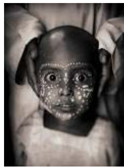
Contemporary Issues © Javier Arcenillas