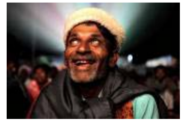
Arts and Culture