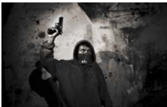
Current Affairs © Javier Arcenillas